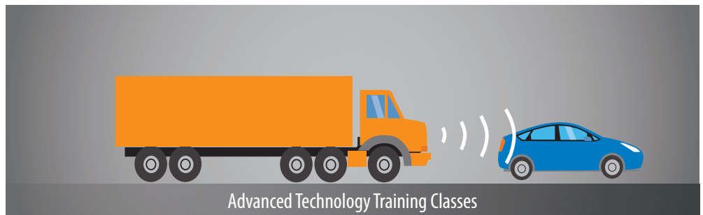
Advanced Technology Training Classes

Curriculum includes the fundamentals of compressed air; tactics for air system failure mode diagnosis and troubleshooting; and air brake system and foundation brake components, including air compressors, valves, foundation drum brakes, and air disc brakes. This all-inclusive course incorporates description, operation, troubleshooting, and service elements for the total range of components within dual air brake systems. Note that depending on the student's technical knowledge, Bendix recommends that each participant complete the online air brake training on brake-school.com before taking our in-person Air Brake Training (3-day class)*.